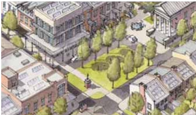
Downtown Hammond, top, University East, bottom. University West, below.